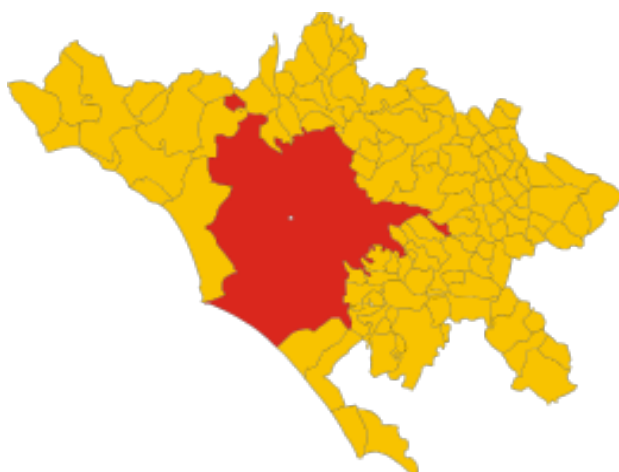
Municipality of Rome (red) in metropolitan city (yellow)

The surface of the municipal district of Rome is 1,287Km 2 , an extremely large extension if one considers most European capitals. Within the territory of the city there is the urban space of Rome, multiple segregated small and big towns, natural reserves, agricultural areas, etc. Both at the administrative level and in citizens' perceptions, the whole area is understood and referred to as "City of Rome". The city, when understood administratively as a municipality, borders with 29 other municipalities, the majority of them very small in extension. Furthermore, the City of Rome, with 91 other municipalities, makes up the Metropolitan City of Rome Capital, known as the Province of Rome until 2014. Further on, the region of Lazio, in addition to the City or Metropolitan Area, includes 4 other provinces, reaching 17,236 km 2 in total. The large extension of the municipality is one of the key elements that define the urban policies with city planning.